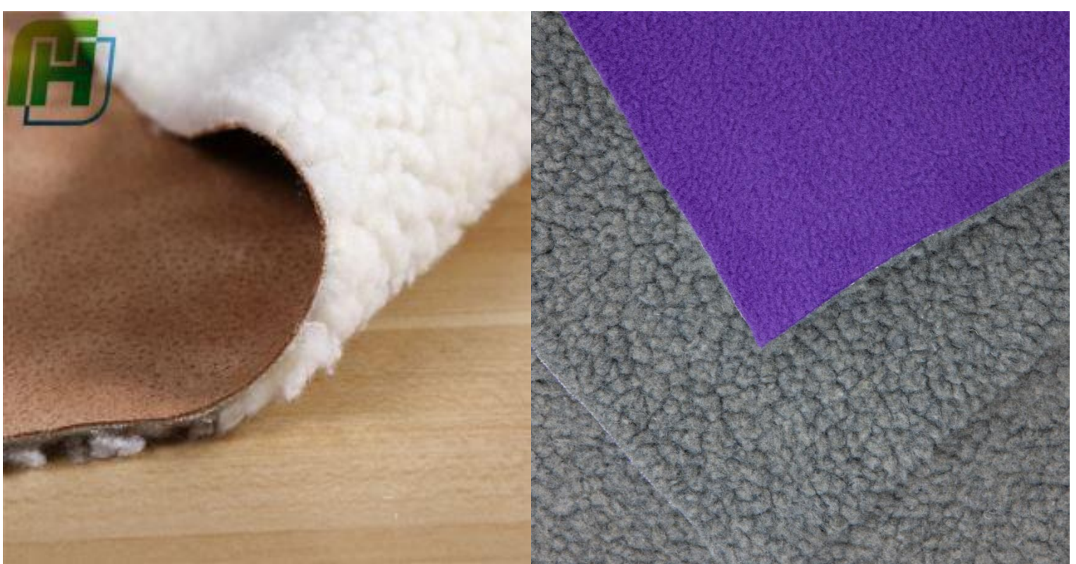
Bonded Sherpa Pile Lining

*** As for delivery of Fabric: Even it is an order of nearly 1(one) million yds: We can ship out with in 2-3 weeks time from L/C and lab dip approval.