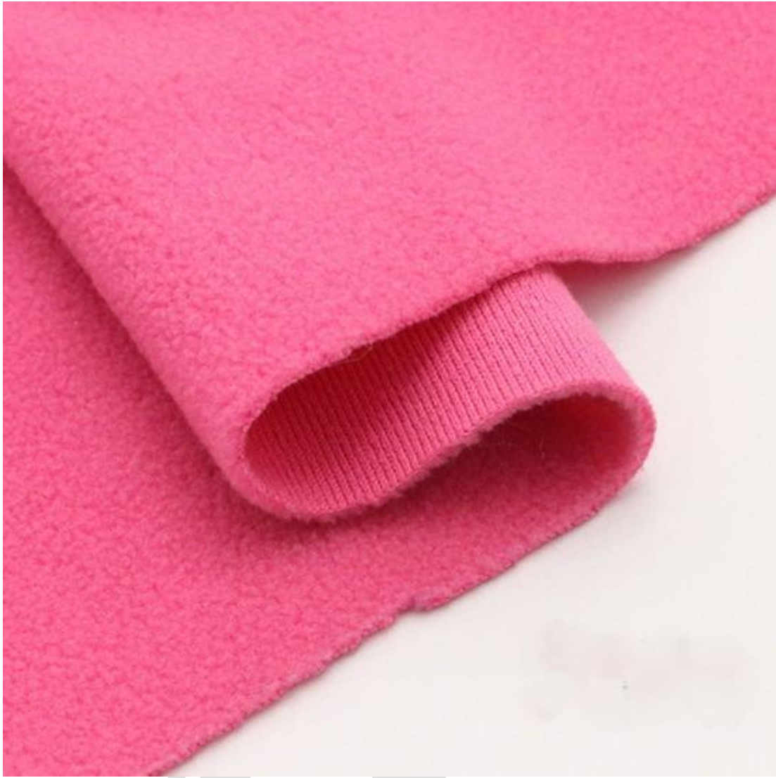
Poly micro fleece