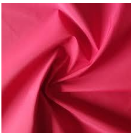
300t poly pongee